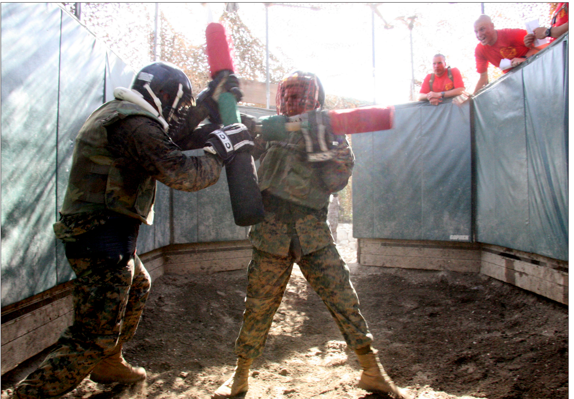
Two recruits battle to the end in the Thunder Dome during the depot's Bayonet Assault Course July 29 while Company C drill instructors provide enthusiastic encouragement.