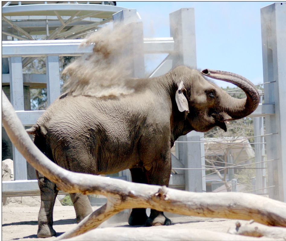
One of the largest existing land animals, the Indian elephant, is on display at the San Diego Zoo. This one decided a dust bath would be just the thing on a hot day in July.

The zoo's hours of operation are 9 a.m. to 9 p.m., daily. The hours are scheduled to change September 8. The zoo is roughly six miles from Marine Corps Recruit Depot San Diego. For more information and directions, visit www.sandiegozoo.org .