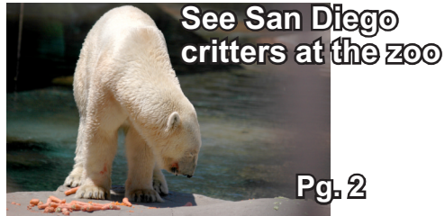
See San Diego critters at the zoo