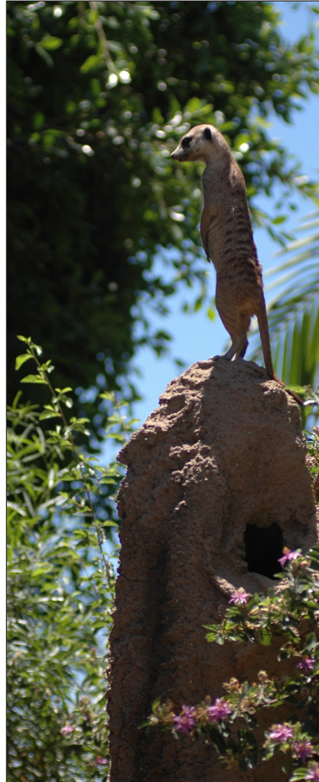
Suffering from the fame brought on by television exposure, meerkats keep a sharp lookout for paparazzi who try to catch them unaware. This time the photographer won the contest.