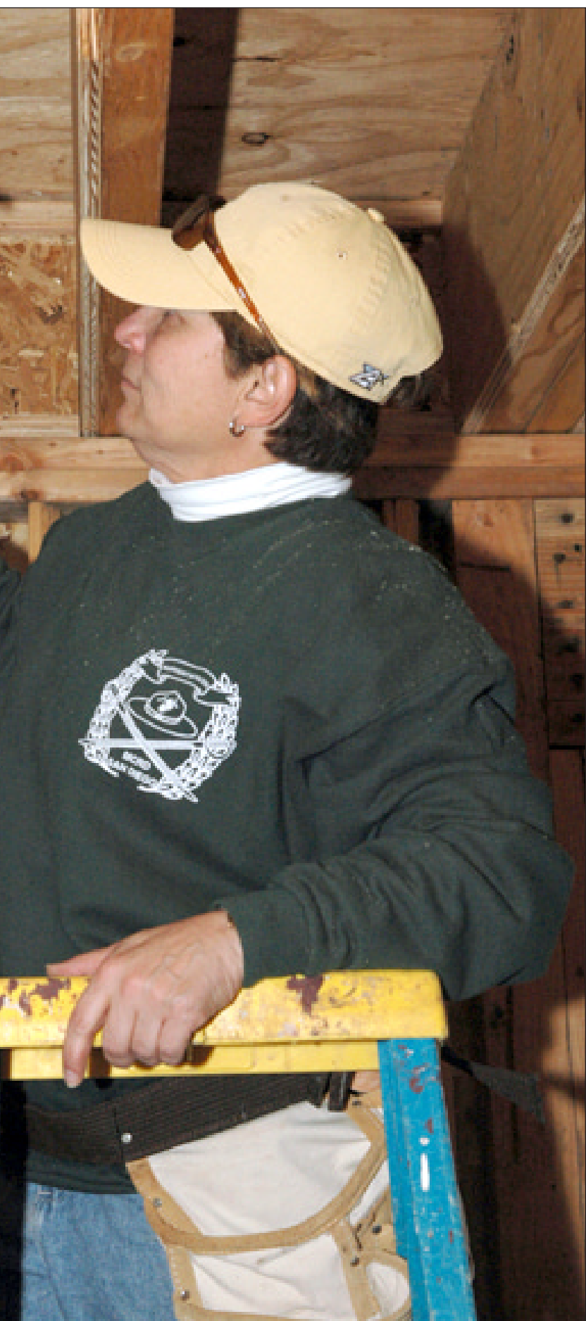
Brig. Gen. Angie Salinas works on a wooden wall, connecting it with the ceiling in support of a Habitat for Humanity project in San Diego from Dec. 4 to Feb. 1, 2007.