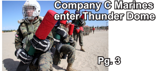
Company C Marines enter Thunder Dome