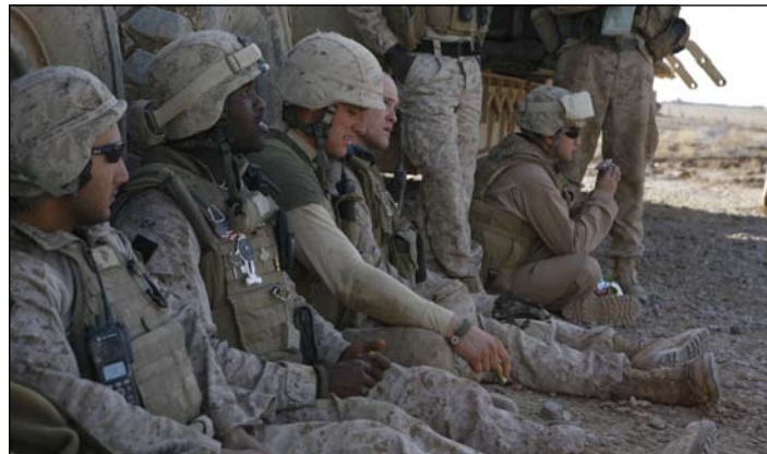
Marines from Alpha Company, 2nd Combat Engineer Battalion, rest after finishing the construction of three makeshift bridges, encountering an improvised explosive device and providing security during a fire fight in Marjah, Helmand province, Afghanistan, Feb. 11.

Marines surveyed the scene to find nothing but mud houses and Afghan goat herders. It appeared the insurgent attack had been only a single improvised explosive device. Alpha Company continued forward, but halted as enemy shots rang out.