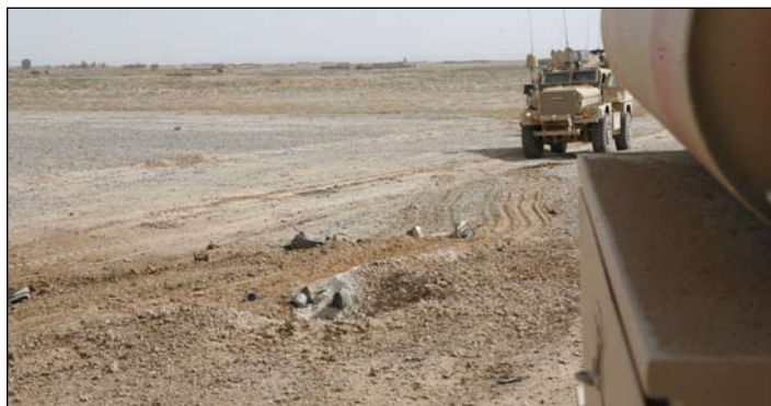
An improvised explosive device detonated after Alpha Company, 2nd Combat Engineer Battalion, built a makeshift bridge across a canal in Marjah, Helmand province, Afghanistan, Feb. 11. The IED did not injure any Marines. Bridges built by Alpha Company provided a route for vehicles and Marines to take into the Taliban stronghold of Marjah.