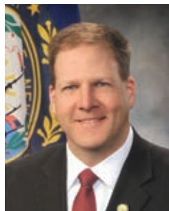
The Honorable Chris Sununu