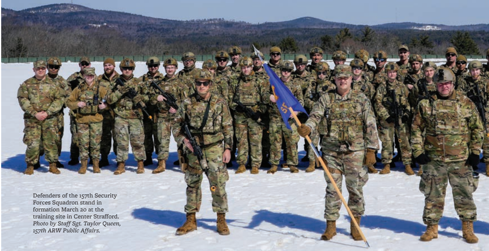
Defenders of the 157th Security Forces Squadron stand in formation March 20 at the training site in Center Strafford.

The 157th Security Forces Squadron conducted a four-day combat readiness exercise March 18 to 21 at Pease Air National Guard Base and the NHNG Regional Training Site in Center Strafford. The training included combatives, first aid, range shooting, land navigation, patrolling, and close quarters battle.