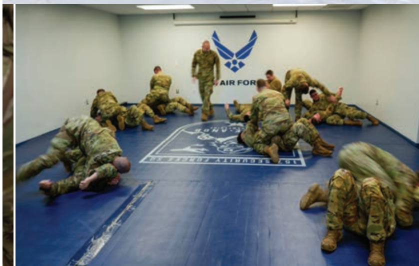
Defenders of the 157th Security Forces Squadron practice ground fighting March 19 at Pease ANG Base.