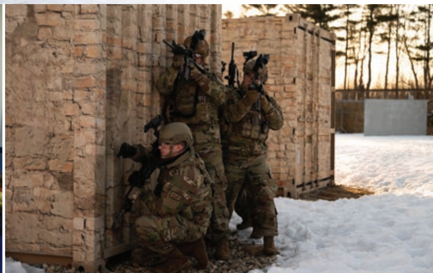
Defenders of the 157th Security Forces Squadron engage a simulated hostile environment March 21 at the training site in Center Strafford.